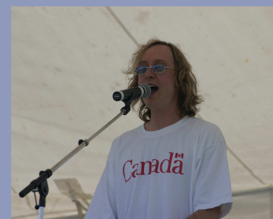
Performing at Columbia Lake, Canada Day 2004